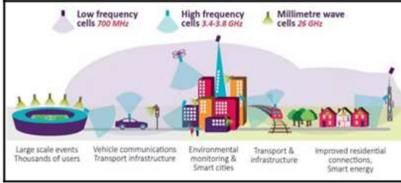
Fig. 1. Wireless communication in life